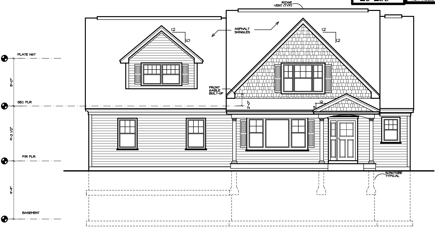
1 FRONT ELEVATION SCALE: 1/4" = 1'-0"